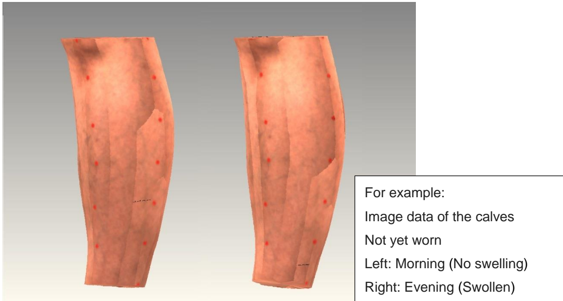
Fig.3 Calf measurement image of morning and evening

-Volume capacity measurement of foot (calves)