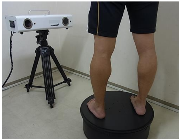
Fig.1 3D scanning using rotary stage

SMARTTECH's 3D scanner purchased this time can acquire not only coordinates but also colors by projecting white pattern light. Therefore, if you put a landmark on the leg with a color pen, sticker, etc., you can easily find the landmark when calculating perimeter by software.