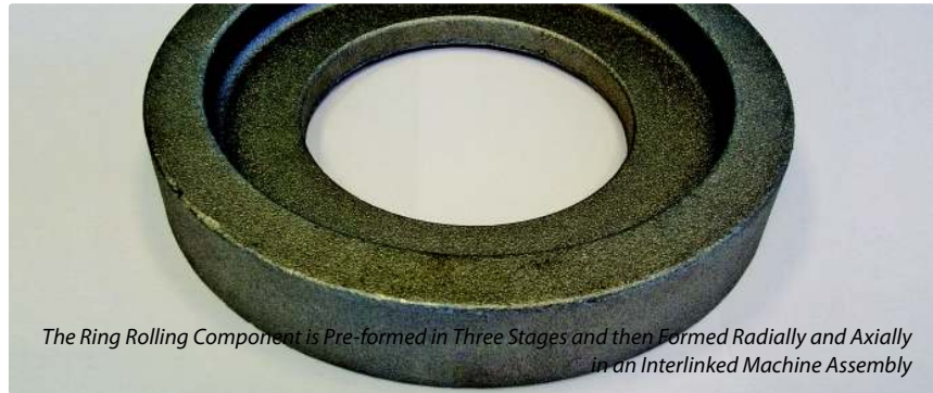
The Ring Rolling Component is Pre-formed in Three Stages and then Formed Radially and Axially in an Interlinked Machine Assembly