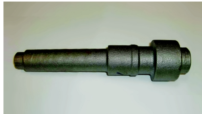
After Inductive Heating to 1240 Degrees, the Component Is Formed on a Cross Wedge Roll

hout process simulation are compared, a 1:10 ratio will be the result. For a definition of the optimal process through real testing, various staff members and expensive machine hours would be needed – possibly multiple times – until the perfect process could be defined. In addition, no production is possible on the machine during the testing time. A comparison with the initial and the running costs of a simulation workstation shows that in most cases, the investment in virtual tools have amortized after only one project.